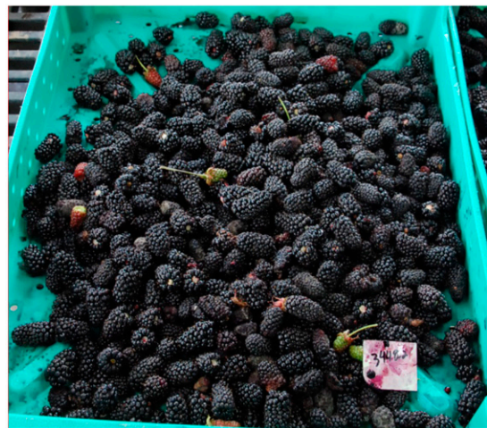
Fig. 3. Flats of harvested fruit (A) hand-harvested ‘Columbia Sunrise’ (l) vs. ‘Columbia Star’ (r) and (B) first pick of machine-harvested (Littau Harvester Inc.) ‘Columbia Sunrise’ fruit.

earlier than that for the other cultivars and, of course, the primocane crop on the primocane fruiting cultivars (Prime-Ark® Freedom, Prime-Ark® Traveler) was in a completely different season 2 months later (Table 5). We believe that ‘Columbia Sunrise’ is the earliest ripening thornless blackberry commercially available. This earliness allows growers to extend their season for fresh and processed markets. Perhaps as important, ‘Columbia Sunrise’ will need fewer insecticide sprays for spotted winged drosophila ( Drosophila suzukii Matsumura) as this pest only begins to build to problematic levels toward the end of ‘Columbia Sunrise’s harvest season.