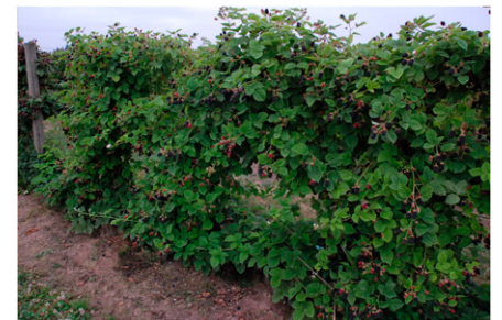
Fig. 4. Fruiting plants of ‘Columbia Sunrise’.

The primocanes of ‘Columbia Sunrise’ were as vigorous as those of ‘Marion’ and ‘Black Diamond’ but were less vigorous than those of ‘Columbia Star’ or ‘Chester Thornless’ (Table 6; Fig. 4). Since the source of thornlessness in ‘Columbia Sunrise’ is from ‘Lincoln Logan’, the canes are entirely thornless,