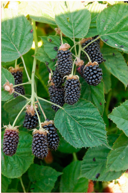
Fig. 2. Ripe fruit clusters of ‘Columbia Sunrise’.

sweetened purées of several genotypes by a blackberry evaluation panel to determine how they compared with industry standards (Table 3). As a purée, ‘Columbia Sunrise’ was rated with ‘Marion’ for aroma, flavor, and overall quality and was rated similar to ‘Columbia Star’ for flavor, color, and overall quality but was scored as having poorer fruit aroma. In informal evaluations of thawed IQF fruit by members of the industry and research communities, ‘Columbia Sunrise’ was regularly noted for its pleasant and very sweet flavor.